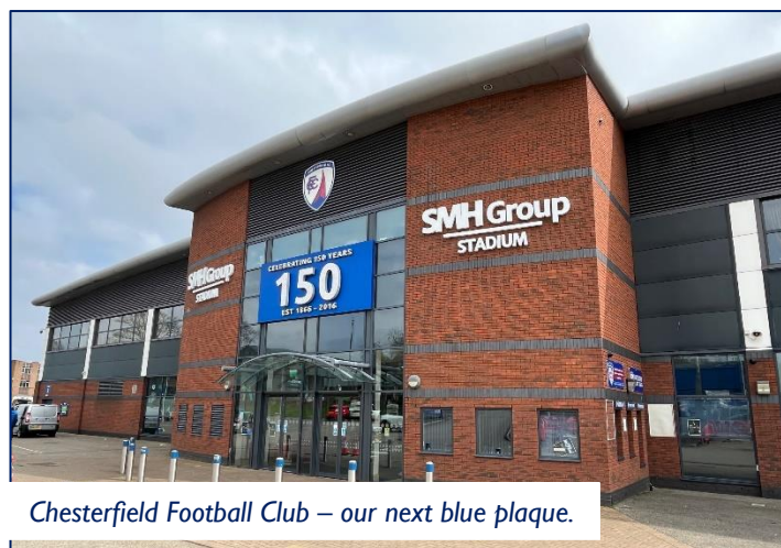
Chesterfield Football Club – our next blue plaque.

At its March meeting the committee gave the go-ahead for our next two blue plaques, subject to necessary arrangements such as funding, design and siting. All new plaque projects now have a project plan accompanying them, which covers such issues as getting stakeholder approval for the site, text, installation and any unveiling ceremony requirements.